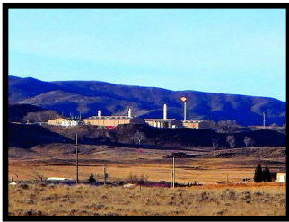
Bucking Horse Gas Plant