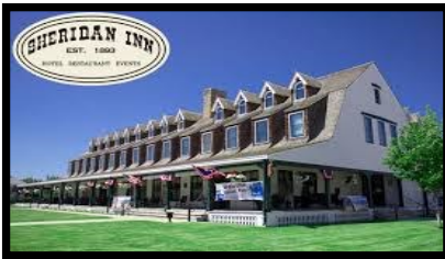
Historic Sheridan Inn