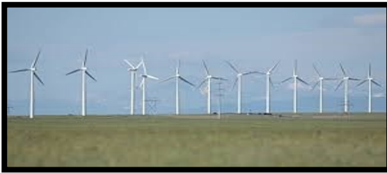
Wind Turbines near Douglas, WY