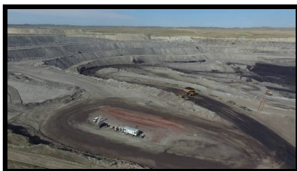
Eagle Butte Mine

9:00 AM Tour of Blackjewel Eagle Butte Coal Mine